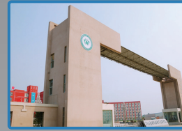
Networked Security: School