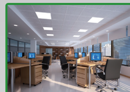
Time Attendance: Office