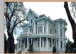
Standalone Access Control: House