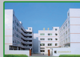
Time Attendance: Factory