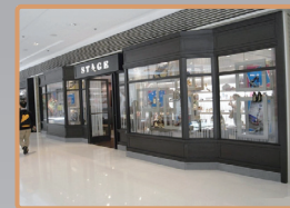
Standalone Access Control: Shop