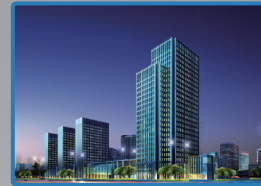
Networked Security: Building