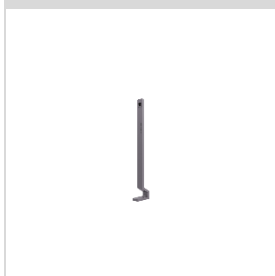
DS-KAB671-B Stand Stick